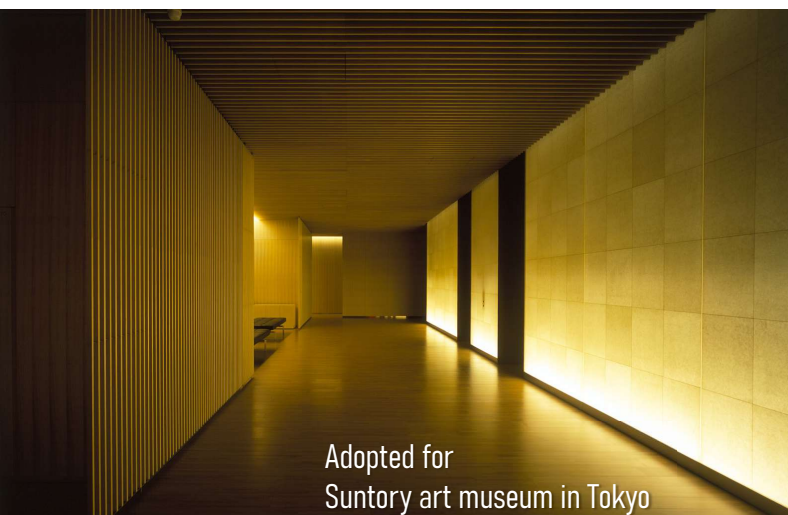
Adopted for Suntory art museum in Tokyo